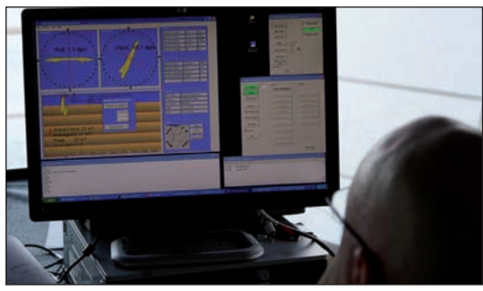
The Vryhof Stevtrack monitors the anchor installation process in real time. The interface main window visualises the anchor's roll, pitch, penetration depth, drag length and pull in force. Separate windows show actual measured figures and for the anchor's position in the mooring system, location and project details.

Sunnva Hyle, manager, soil mechanics, BW Offshore: