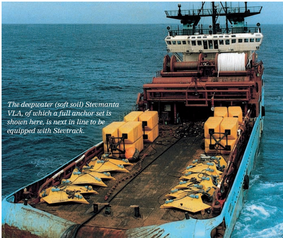
The deepwater (soft soil) Stevmanta VLA, of which a full anchor set is shown here, is next in line to be equipped with Stevtrack.