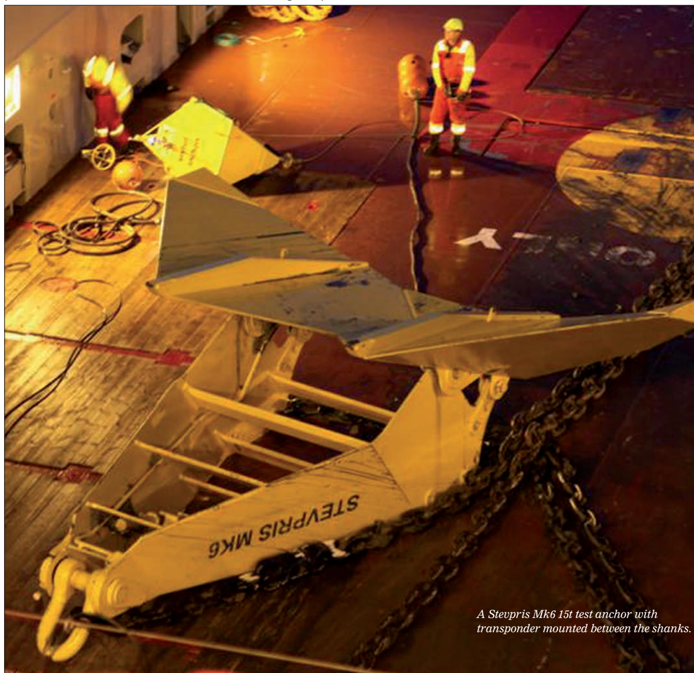
A Stevpris Mk6 15t test anchor with transponder mounted between the shanks.

With holding power over 100 times their own weight as well as clear economic advantages, the first drag embedment anchors made quite a splash in the offshore industry in the 1970s. Yet some project engineers still feel more comfortable with pre-determined fixed mooring points without the possibility of drag. Vryhof is looking to change all that with a system that provides factual data during and post installation and much else besides, as David Morgan reports.